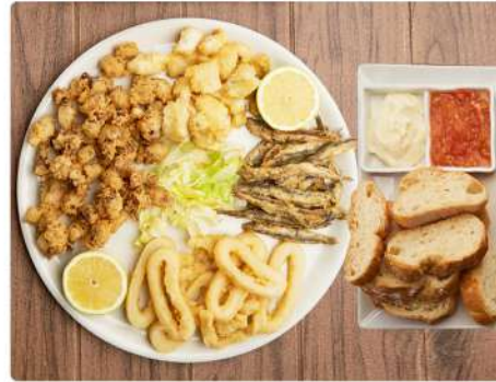
2. MIXED DEEP FRIED FISH 27€