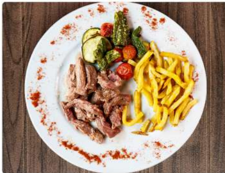
3. FLANK STEAK 14€