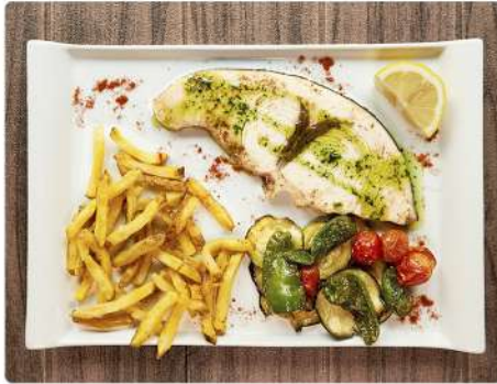
1. EMPEROR 15€