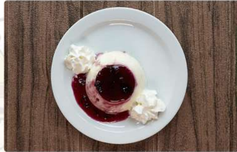
2. PANNA COTTA: 3€