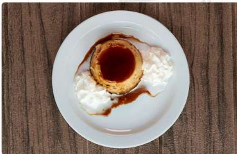
4. EGG FLAN : 3€