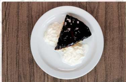
3. CHEESE CAKE WITH CRANBERRIES: 4€