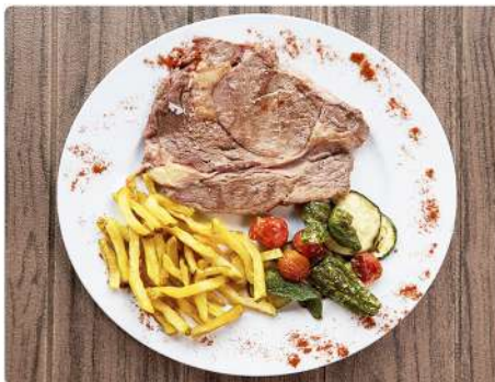
5. BEEF ENTRECOTE 16€