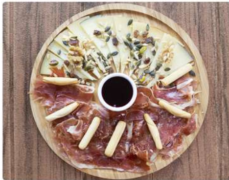
9. SERRANO HAM BOARD AND MANCHEGO CHEESE 16€