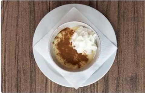
1. TIRAMISU: 3.50€