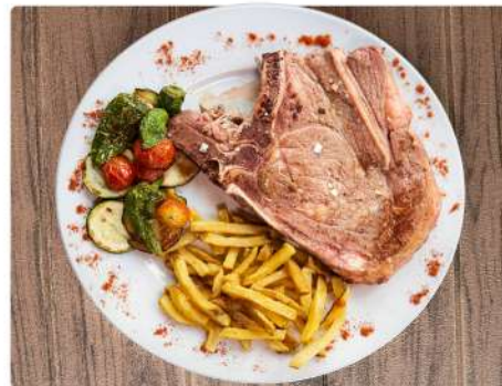
6. RIBEYE STEAK 400/500g .....18€ 700/800g ..... 23€