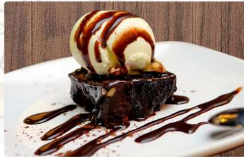
5. BROWNIE WITH ICE CREAM 5€