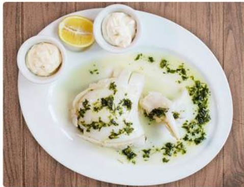
10. CUTTLEFISH: 12.00€