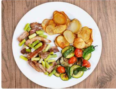
8. IBERIAN SECRET: 13€