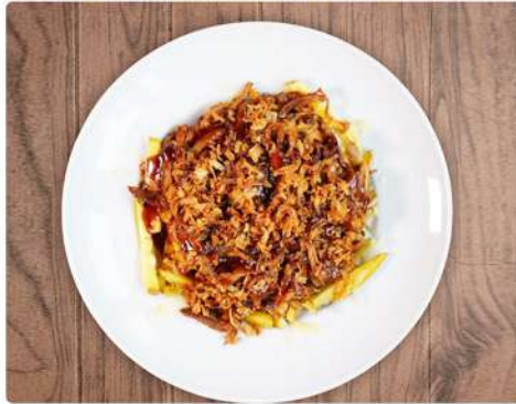
7. POTATOES RDC: 11€