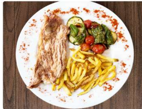
4. BEEF SHORT RIBS 13€